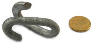
Chain Connecting Link 8mm galvanised