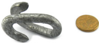
Chain Connecting Link 10mm galvanised 316 welded