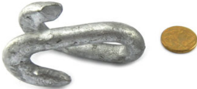
Chain Connecting Link 8mm galvanised 316 welded