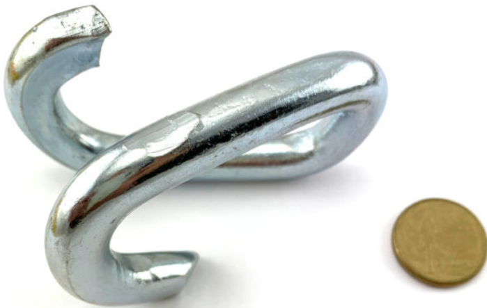
Chain Split Link / Connecting Link - Zinc - 12mm