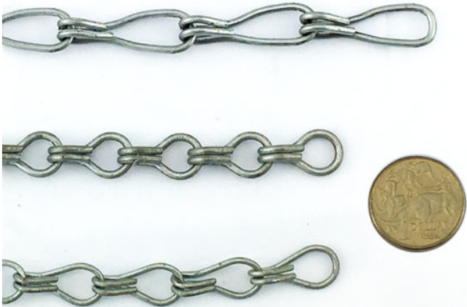
Double Jack Chain range