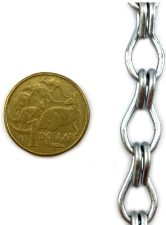
Double Jack Chain - Galvanised - 2mm