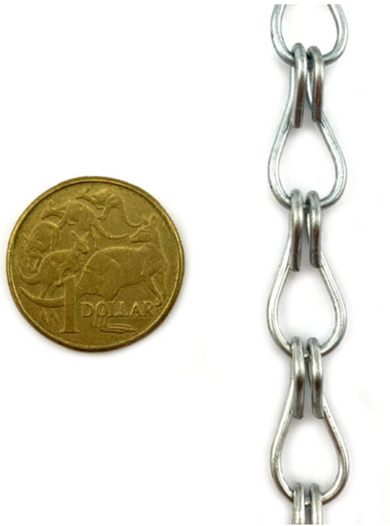
Double Jack Chain - Galvanised - 1.6mm