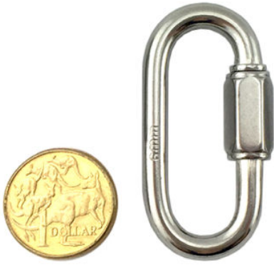
Quick Link Stainless Steel 6mm