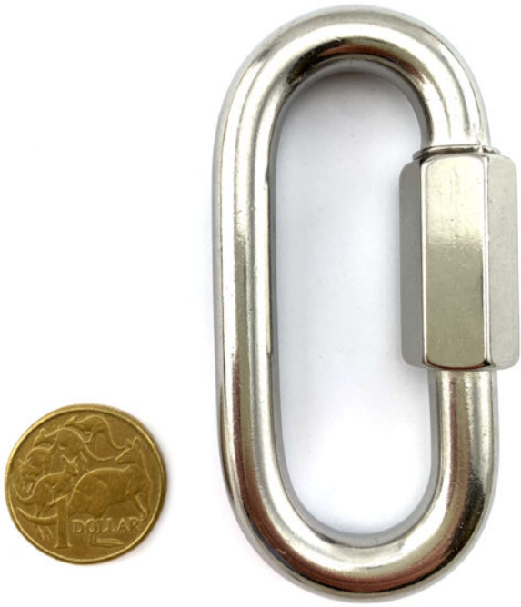
Quick link stainless steel 10mm