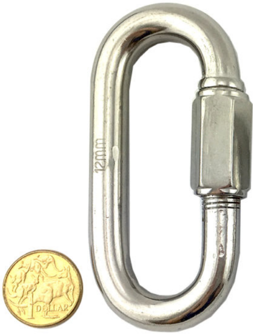
Quick Link Stainless Steel 12mm