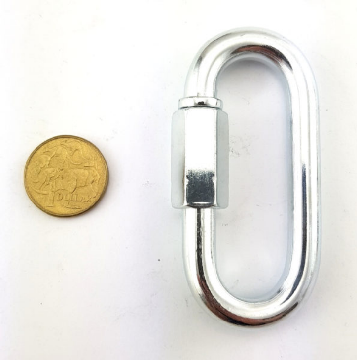
quick link zinc plated 10mm