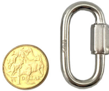
Quick Link Stainless Steel 5mm