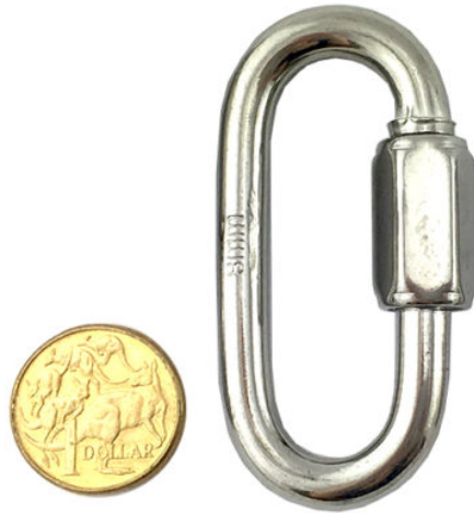
Quick Link Stainless Steel 8mm