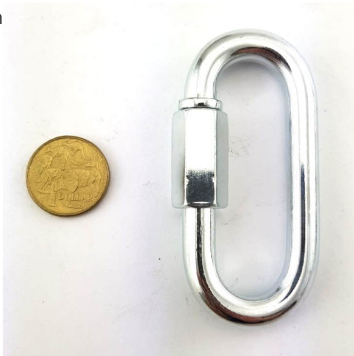
Quick link zinc plated 12mm