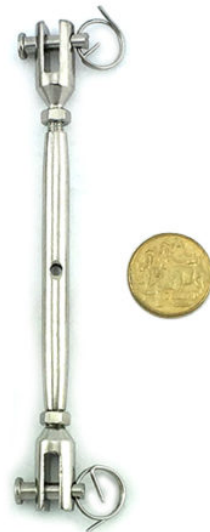
jaw to jaw closed body turnbuckle 5mm