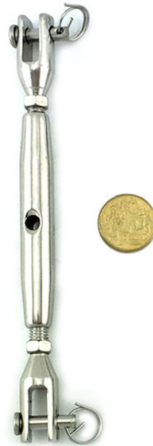
jaw to jaw closed body turnbuckle